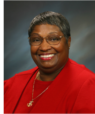
Alexa Irene Canady