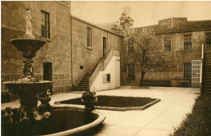
View of the women's courtyard, San Quentin Prison, ca. 1915.