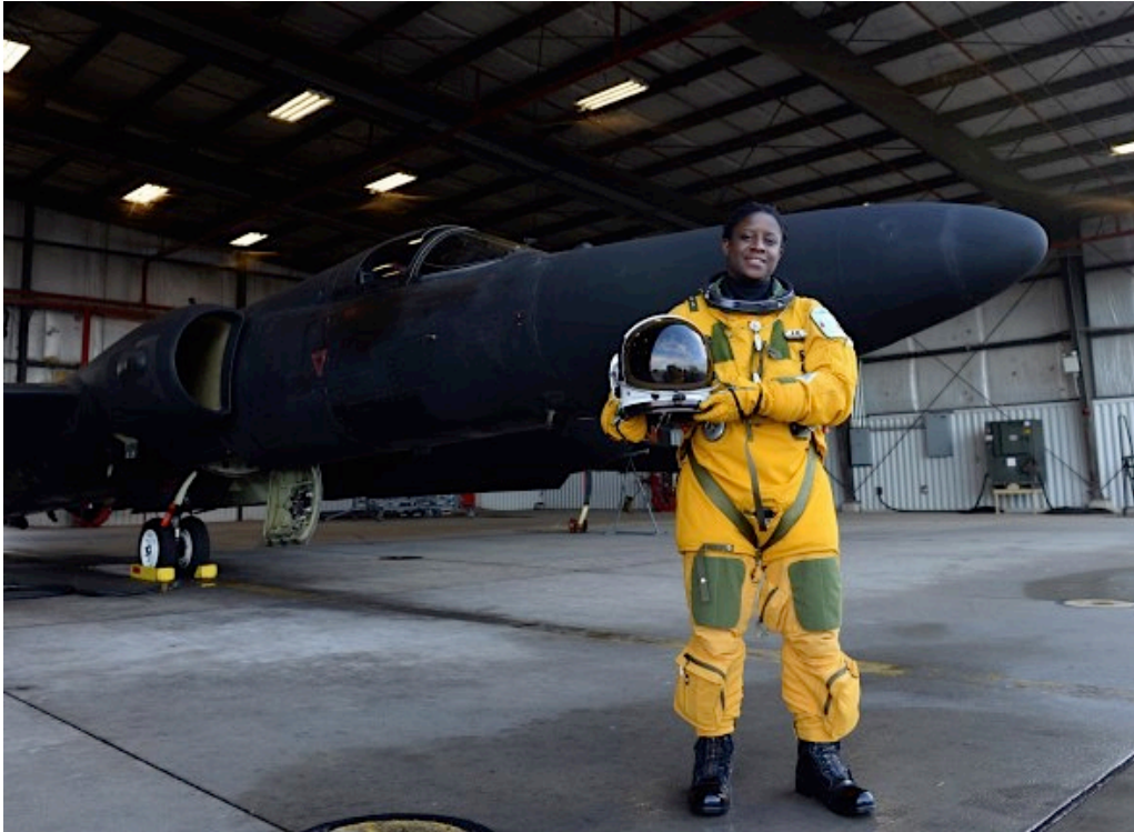
Lt. Col. Merryl Tengesdal became the first female African American to pilot the U-2 — an ultra-high altitude reconnaissance aircraft used for intelligence gathering.

FIND OUT ABOUT THE CONTRIBUTIONS THAT AFRICAN AMERICANS HAVE MADE TO U.S. HISTORY