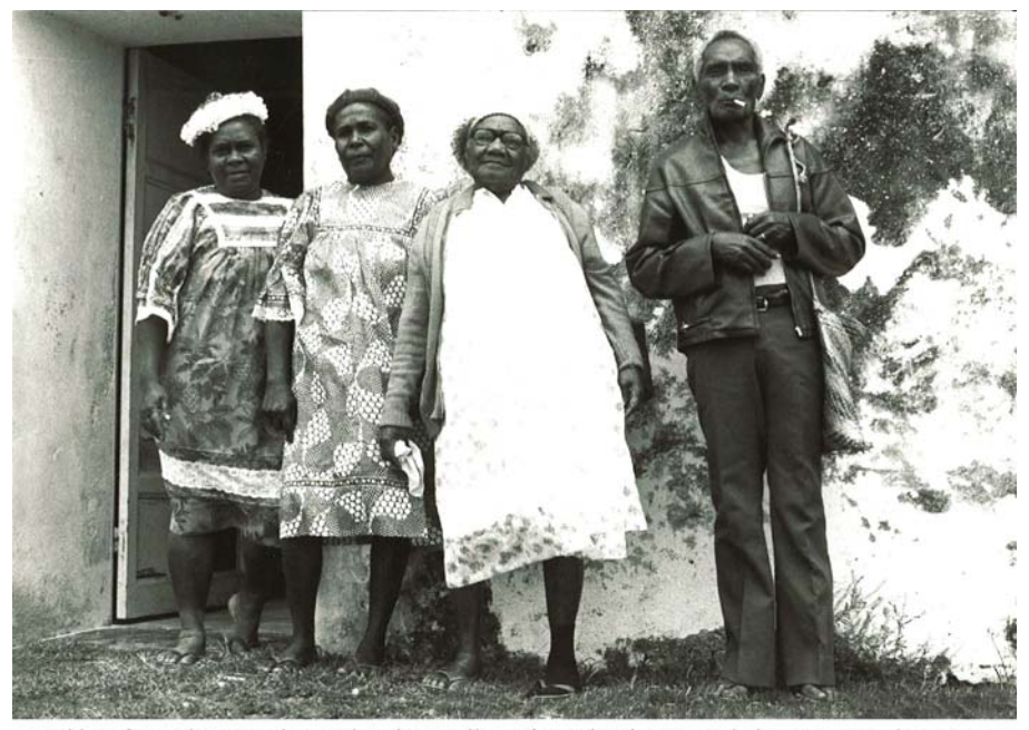
Elders from the Unë clan, tribe of Luecilla, Lifou Island, New Caledonia (December 1983)

I spent two years in New Caledonia, in a small research team—there were only three of us—at the time of the Kanak uprising of November 1984. So I lived and worked in a very brutal and archaic colonial society, because New Caledonia in the 1980s was a colony of the nineteenth-century type that had survived virtually intact to the end of the 20<sup>th</sup> century. It was an extraordinary social experience for an apprentice-sociologist to conduct research on the school system, urbanization, and social change in the context of an insurrection, under a state of emergency, and to observe in real time the struggles between the colonials and the independence forces, and to have to reflect in a concrete way about the civic role of social science. I was privileged to participate in a closed congress of the Kanak Socialist National Liberation Front in Canala, and I also traveled all the way around the "Grande Terre" (the main island) and made several sojourns in Lifou island at the home of friends who were long-time Kanak militants at a time when practically no one was moving about in the territory.