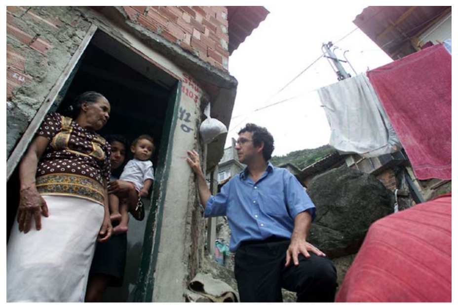
In the favela of Santa Marta, Rio de Janeiro (April 2001)

dispossession of the cities of the Second World, whether they be the favelas of Rio de Janeiro, the townships of Cape Town, or the varoş of Istanbul.