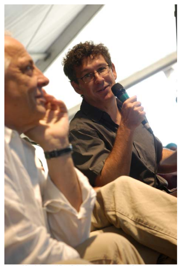
A public debate with political journalist Daniel Mermet at the Fête de l'Humanité (September 2003)