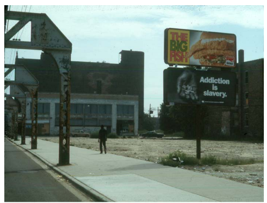
Urban desolation on 63rd Street, South Side of Chicago (July 1989)

LW: In fact, two unforeseen events came together to derail my initial plans. On the one side, the New Caledonian gates were abruptly shut: in Nouméa, the mediocre bureaucrat who had been my supervisor abused his authority to put his name against my will as a co-author on a monograph about the school system that I had carried out by myself—sadly, this was a common practice at ORSTOM. I filed a complaint against this intellectual embezzlement with the directors of the Institute in Paris, who hastened to cover up for the cheater. The result was that I was banned from that agency and consequently from the island. On the other side, I found myself confronted day-to-day with the gruesome reality of Chicago's ghetto. I lived at the edge of the poor black neighborhood of Woodlawn, and it was a constant tremor to have under my window this quasi-lunar urban landscape, with its unbelievable decay, misery, and violence, backed by a totally hermetic separation between the white, prosperous and privileged world of the university and the abandoned African-American neighborhoods all around it. (The Hyde Park campus is bordered on three sides by the South Side ghetto and on the fourth by Lake Michigan.) This queried me profoundly on a quotidian level. It is at this point that the second decisive encounter of my intellectual life took place, the one with William Julius Wilson.